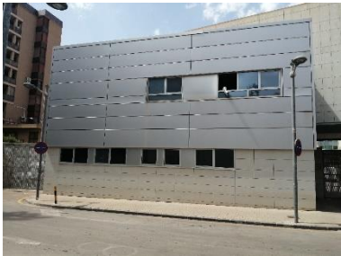
OLD MAINTENANCE BUILDING OF THE REINA SOFÍA HOSPITAL NEW HGU REINA SOFÍA MAINTENANCE BUILDING

The achievement of the planned goals is shown through a graphic comparison of the old laboratory facilities at the Regional Government of Health and the new facilities resulting from this action.