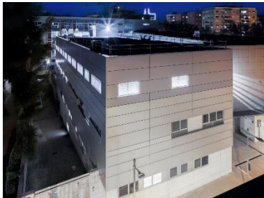
OLD FACILITIES AT THE REGIONAL MINISTRY OF HEALTH HEADQUARTERS NEW FACILITIES IN THE HGU REINA SOFÍA MAINTENANCE BUILDING